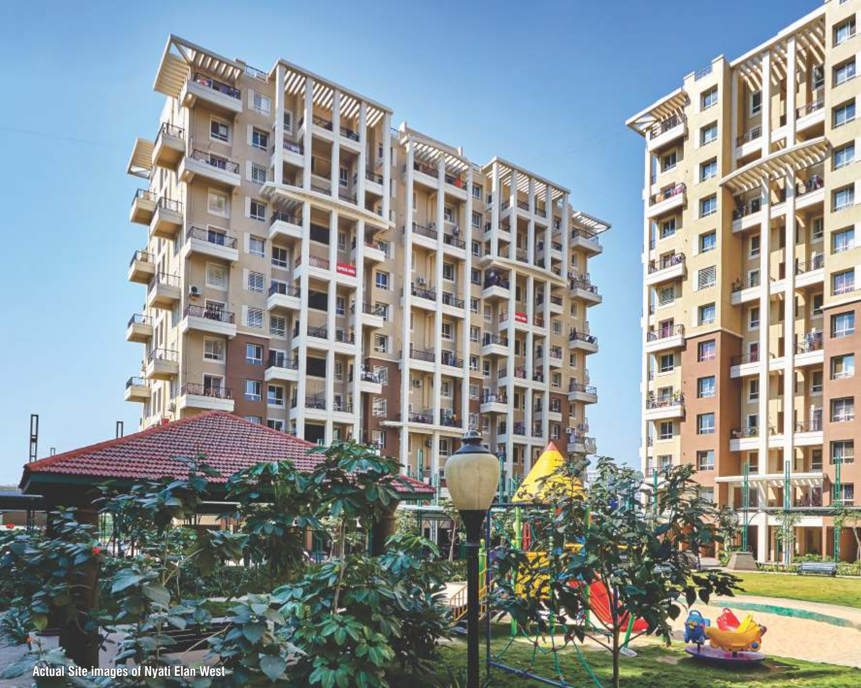
Actual Site images of Nyati Elan West