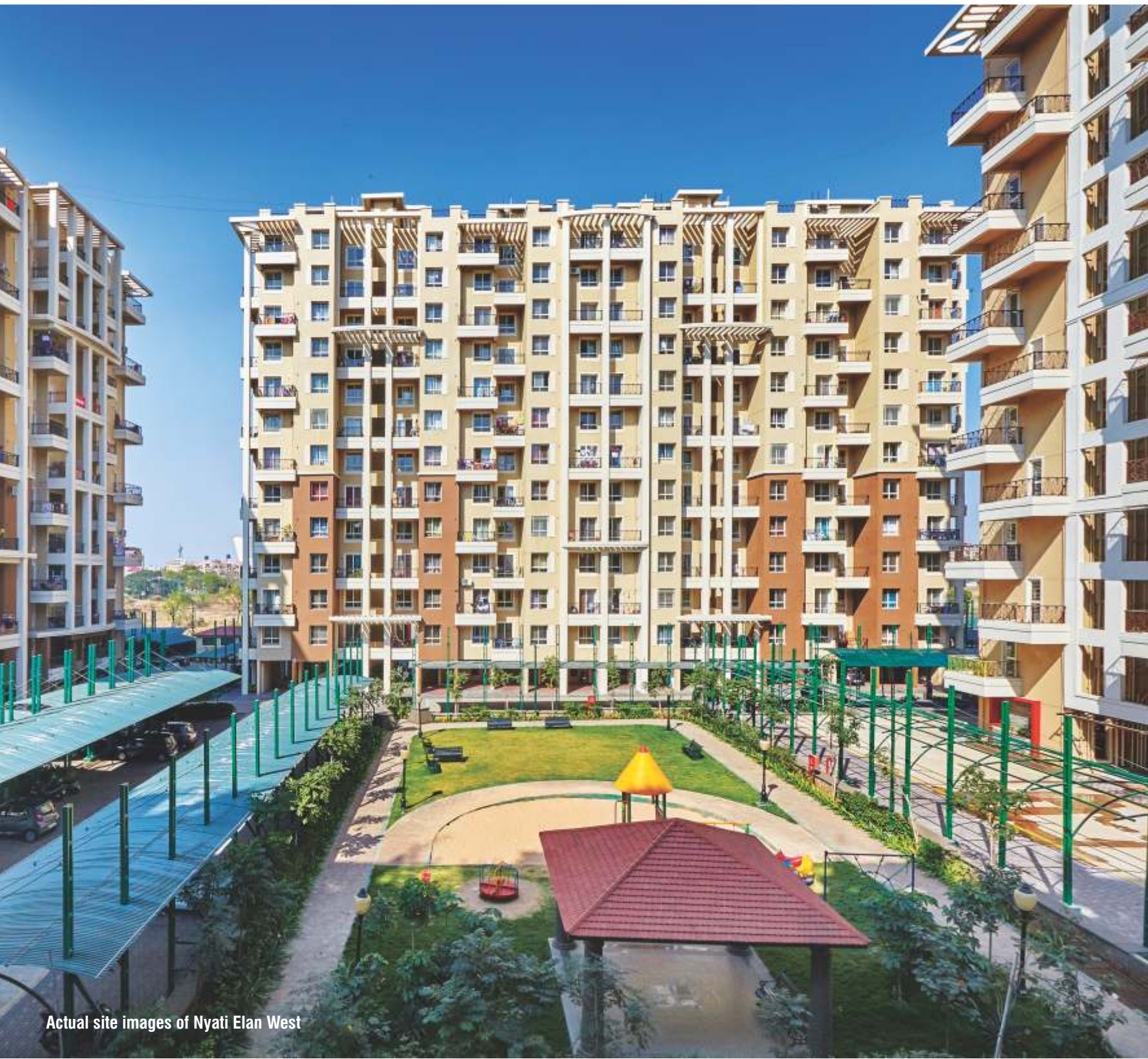
Actual site images of Nyati Elan West