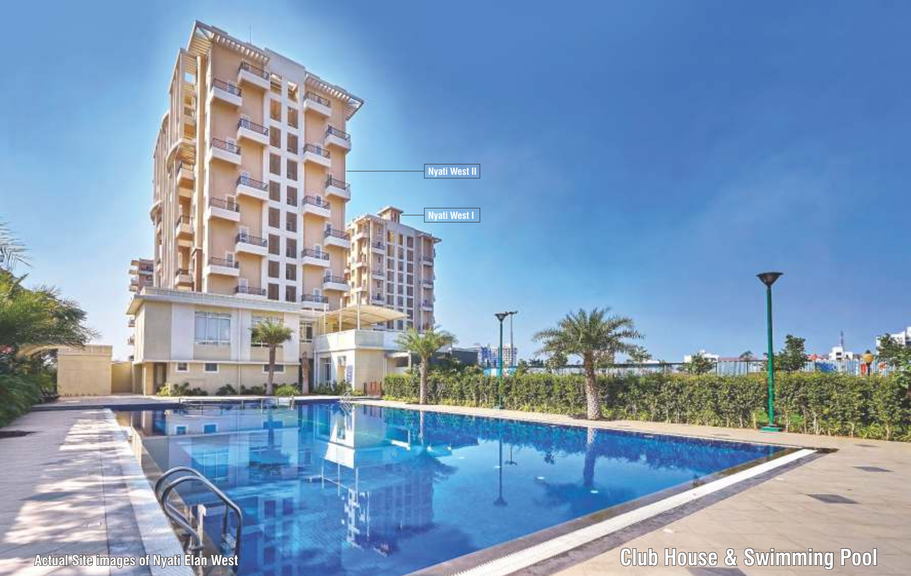
Actual Site Images of Nyati Elan West