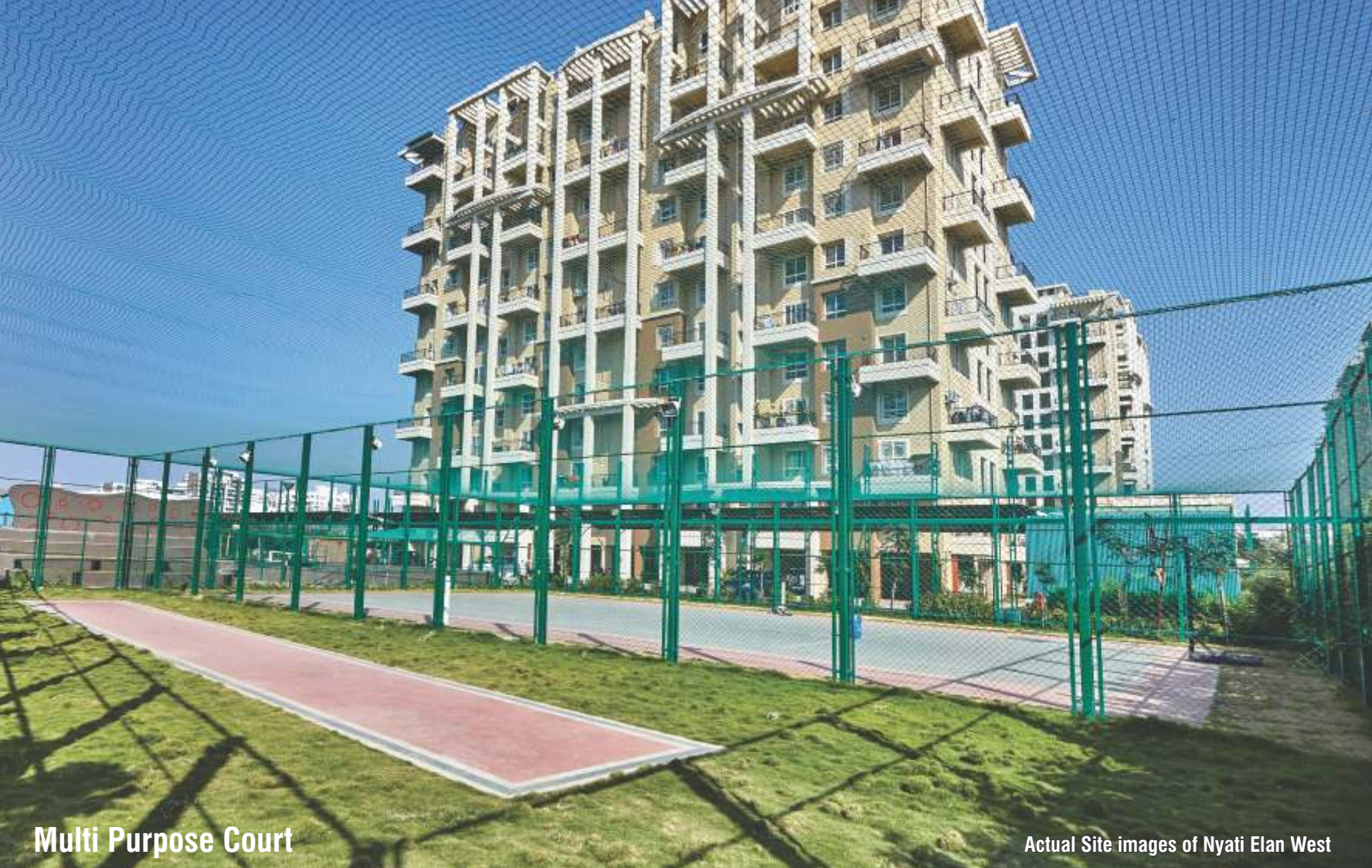
Multi Purpose Court